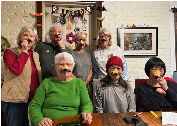
The Origami Group getting silly with their folded creations!